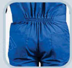
Back Waist Fitting