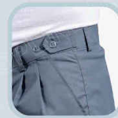
Loops in Pant