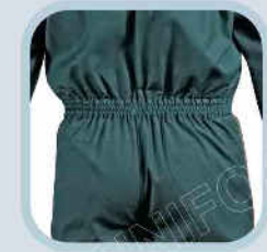
Back Waist Fitting