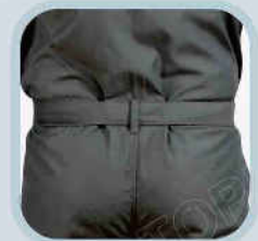
Back Waist Fitting