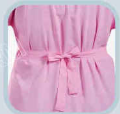
Back side Fitting