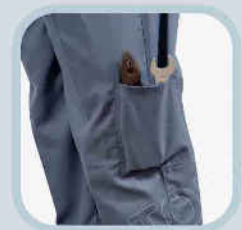
Side Bottom Pocket