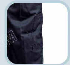
Bottom Left Side Pocket