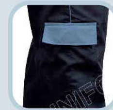
Bottom Right Side Pocket