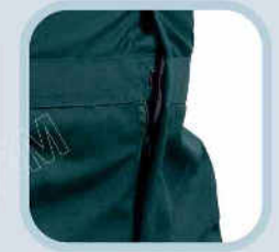
Front Waist Fitting