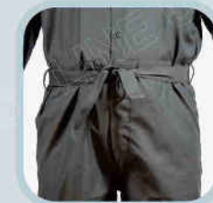
Front Waist Fitting