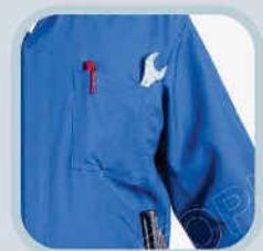
Front Top Pocket