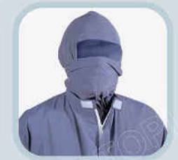
Zipper with Velcro