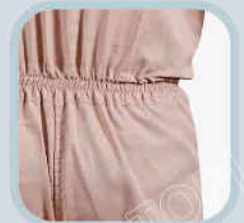
Waist Elastic Fitting