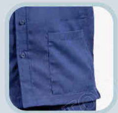
Bottom Side Pocket